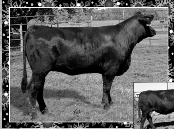
RCC/TCF Real Sweet H72