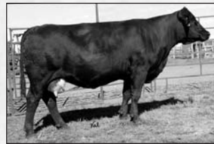
RCC/TCF Real Sweet H72

Polled Black Purebred ASA#Pending BD: 2-24-05 Tattoo: R5104 Act. BW: 100 Act. WW: 700