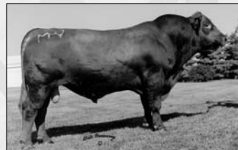
MV Red Light 406