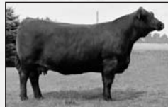
HF/GFI Ruby Red

Sarges Blk Ram is a stout, long sided bull calf that moves very free in his make up. He should make a great calving ease bull. Do not let his 97 pound birth weight scare you as he was born unassisted.