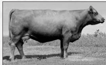
BOZ Sweet Temptation

SS Goldmine L42 WLE Power Stroke Triple C Sweet & Sassy N GW Miss Lucky Buck 858G BOZ Sweet Temptation