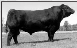
KenCo/MF Powerline 204L

KenCo/MF Powerline 204L HC Power Drive 88H SAFN Glamour 11J Lady Sarge M2042 GW Bright Light 019H Lady Sarge E5013