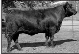
GFI Josie L24

Dam's Ranks: WW Top 20% YW Top 20% MCE Top 15%